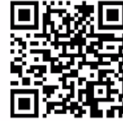
2024 Climate Change in Colorado Report