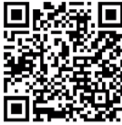
ULC Task Force Final Report